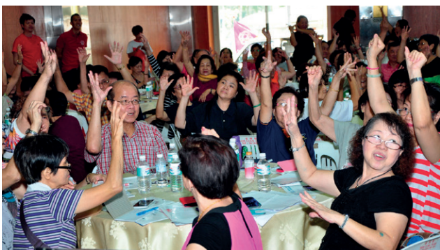
(top) Two Singtel management members (far right) flagged off at the event (above) Singtel volunteers (in red t-shirts) at our Silver Mobile Workshops teaching the seniors to use smartphones and mobile apps